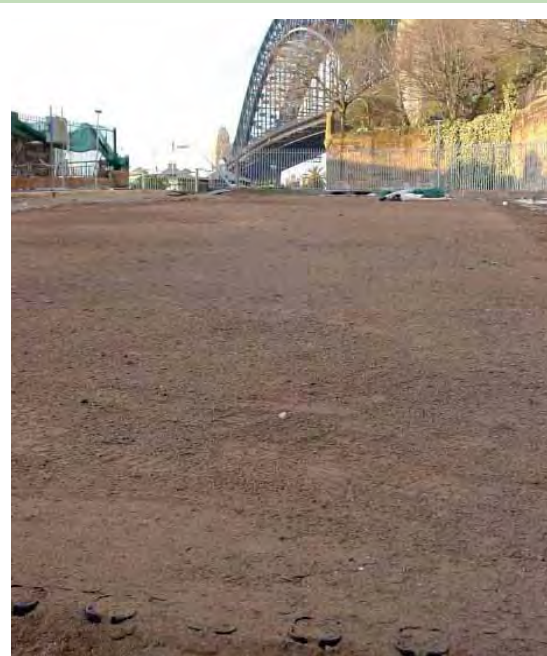
TurfPave in-filled with a free draining 80% sand and 20% organic mix promotes vigorous turf growth