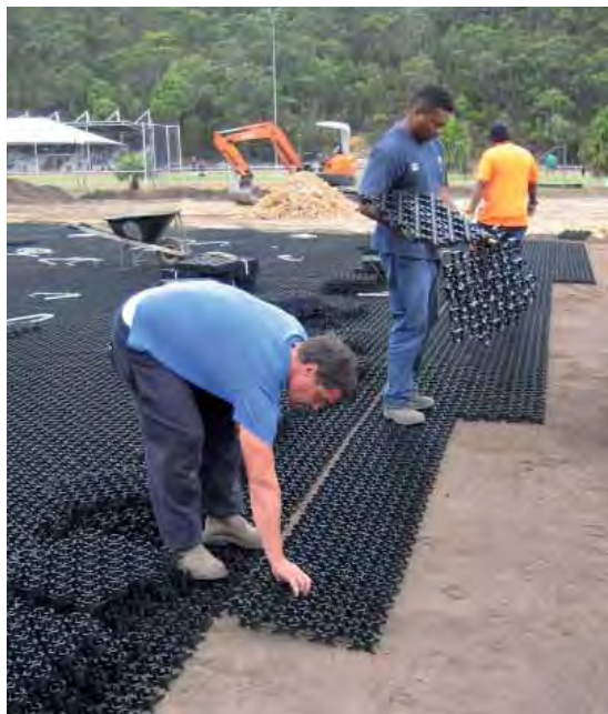
TurfPave modules securely interlock, conform to uneven surfaces and are easy to install