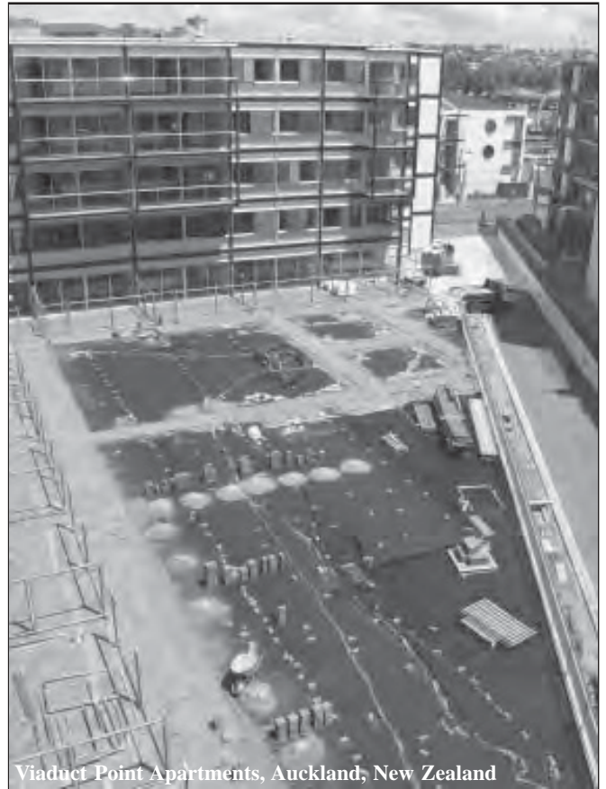
Viaduct Point Apartments, Auckland, New Zealand

This 1100 m 2 project was designed for the purpose of resident parking. VersiCell modules were placed and locked together. Syntex nonwoven geotextile was laid over the VersiCell to act as a separation layer. Coarse washed sand to a depth of 20 mm was then placed over the entire geotextile to allow for even placement of the paving stones. The area was made