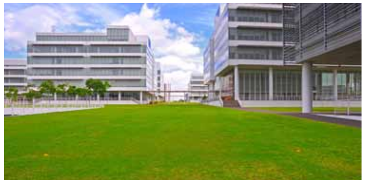
Fire Engine Access